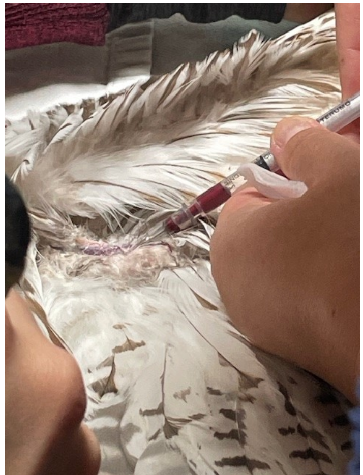
Taking a blood sample from a Red-tailed Hawk at Hawk Cliff Banding Station