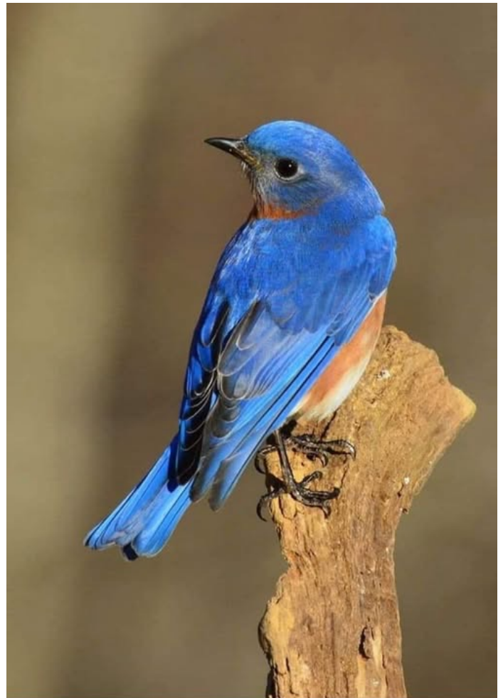
Beautiful shot of an after second year male. No moult limits in the upper coverts. Most of the orange edging has worn off by this date. Photo was just taken recently.

this has not been confirmed. We need to examine all the nest box grids in Ontario to determine if the reproductive success is what it should be. Are these grids really helping Tree Swallows. Maybe in the next newsletter.