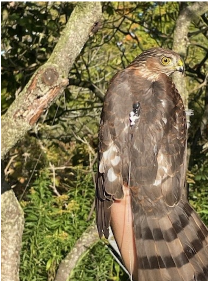
A motus tag has been fitted on this hatch-year female Sharp-shinned Hawk.