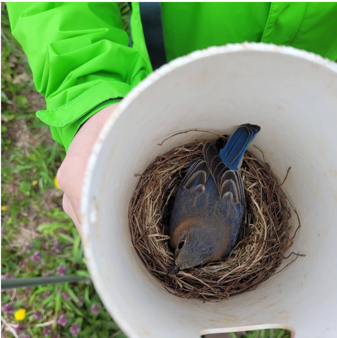
One of Dan's female bluebirds that stayed on the nest as he was checking the nest box .