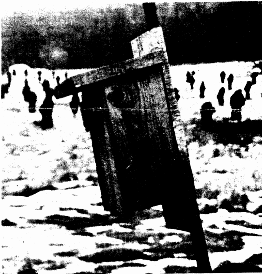
A standard nesting box with a 3/4 in. predator guard.

The fifth test involved increasing the roof overhang from the standard 2 in. to 7 in. [17.8 cm] on a box mounted on 7/8 in. water pipe. The second box had a standard size roof and was mounted on a 3 in. [7.6 cm] PVC pipe. During the first two days of the test the raccoon did not feed from either box. For the next 9 days it removed from 82-98% of food from the shorter roof box mounted on the PVC pipe. In the box with the extremely long overhang, it was unable to remove any food for the first nine nights. On the last two nights it removed 86% and 73% of the pellets. It would appear that the raccoon was highly challenged by this long extension of the roof. It is